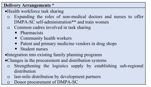
Fig. 2 Delivery arrangements to scaling up DMPA-SC self-administration programs

*How, when, and where DMPA-SC client self-administration was organized and delivered, and who delivered DMPA-SC client self-administration activities, **Self-administration of depot medroxyprogesterone acetate subcutaneous injectable contraception